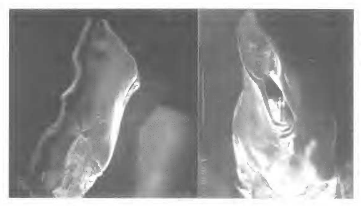
FIG. 2. Lepidiota clareae, male parameres.

circular, white scales, except for bare triangular area in the middle along the posterior margin. Frons with anterior part evenly punctate, each puncture bearing a white scale, punctures and scales more dense above the eyes; posterior third with a dense band of elongate scales and then bare posteriorly. Antennae 10- segmented, club 3-lamellate, club 1.3mm long and as long as segments 2-7 combined. Pronotum slightly wider across base than in middle, greatest width 1.7x the mid length, lateral edges obviously angulate in middle, edges behind these angles almost parallel when seen from above but each indented slightly; anterior angles obviously obtuse, posterior angles square; with defined anterior and posterior margins; surface densely clothed with rounded scales, scales more densely crowded towards the posterior part of the lateral margins and especially on the posterior margin. Scutellum with circular scales smaller and denser across anterior quarter, larger and more scattered on remainder. Elytra uniformly clothed with white, circular scales. Propygidium without a ridge above each posterior angle on each side, scales on posterior third small, circular to slightly elongate, fairly uniform in size and separated by 1 diameter or more. Pygidium densely clothed with oval, white scales, scales denser and more elongate medially and towards apex. Pronotal hypomera with elongate scales except in a median